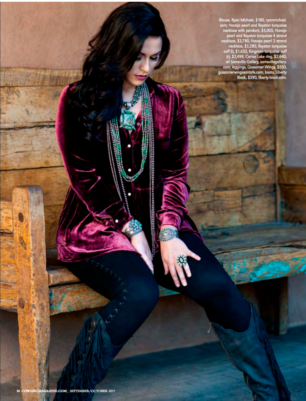
Blouse, Ryan Michael, $180, ryanmichael.com; Navajo pearl and Royston turquoise necklace with pendant, $5,005, Navajo pearl and Royston turquoise 4 strand necklace, $3,780, Navajo pearl 3 strand necklace, $2,280, Royston turquoise cuff (l), $1,653, Kingman turquoise cuff (r), $2,499, Carico Lake ring, $2,640, all Samsville Gallery, samsvillegallery.com; leggings, Gossamer Wings, $550, gossamerwingsantafe.com; boots, Liberty Black, $390, liberty-black.com.