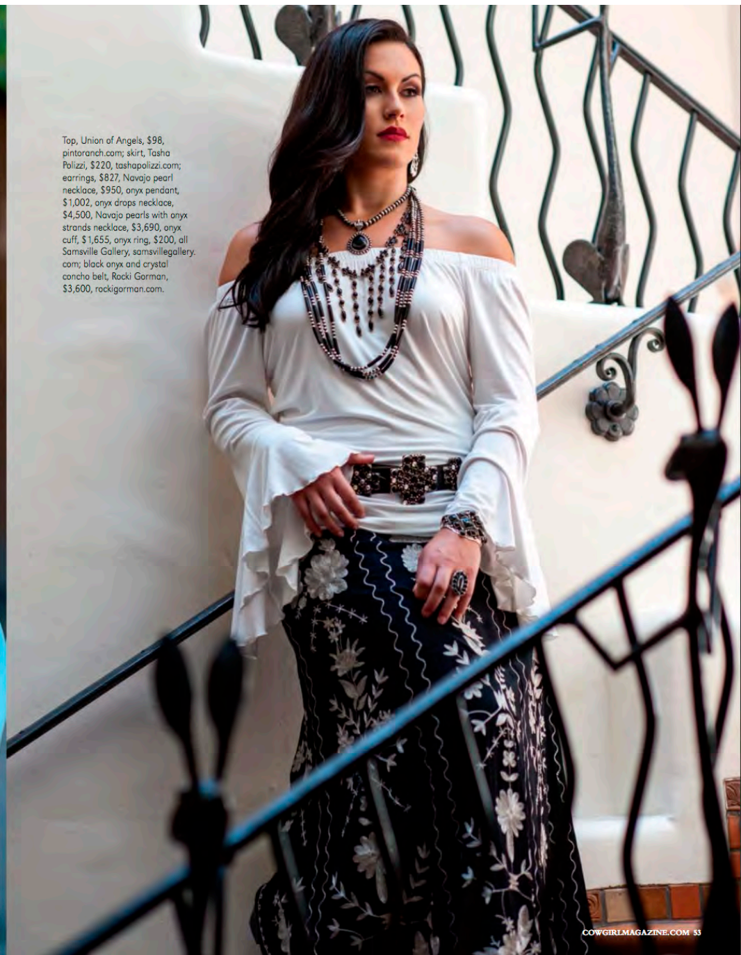
Top, Union of Angels, $98, pintoranch.com ; skirt, Tasha Polizzi, $220, tashapolizzi.com ; earrings, $827, Navajo pearl necklace, $950, onyx pendant, $1,002, onyx drops necklace, $4,500, Navajo pearls with onyx strands necklace, $3,690, onyx cuff, $1,655, onyx ring, $200, all Samsville Gallery, samsvillegallery.com ; black onyx and crystal concho belt, Roki Gorman, $3,600, rockigorman.com .