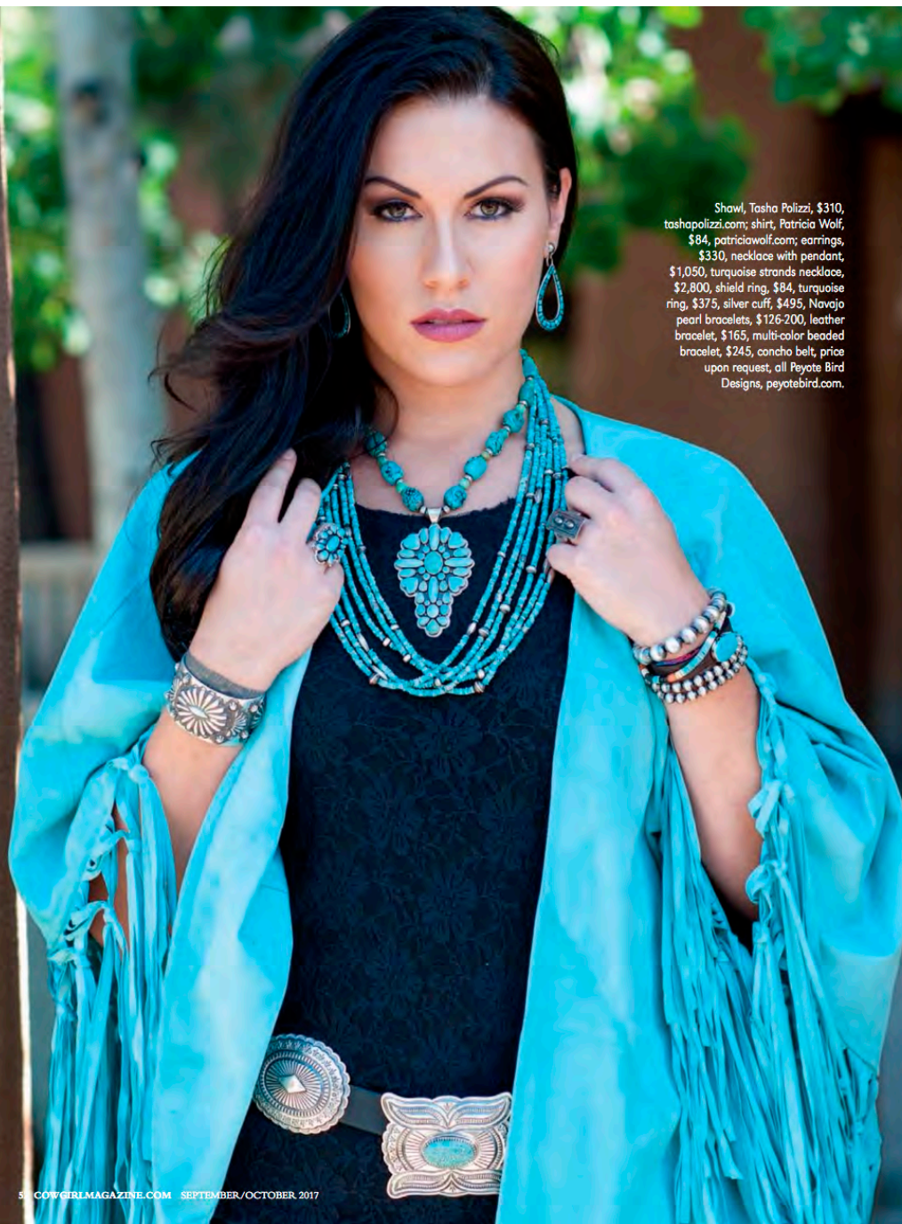
Shawl, Tasha Polizzi, $310, tashapolizzi.com ; shirt, Patricia Wolf, $84, patriciawolf.com ; earrings, $330, necklace with pendant, $1,050, turquoise strands necklace, $2,800, shield ring, $84, turquoise ring, $375, silver cuff, $495, Navajo pearl bracelets, $126-200, leather bracelet, $165, multi-color beaded bracelet, $245, concho belt, price upon request, all Peyote Bird Designs, peyotebird.com .