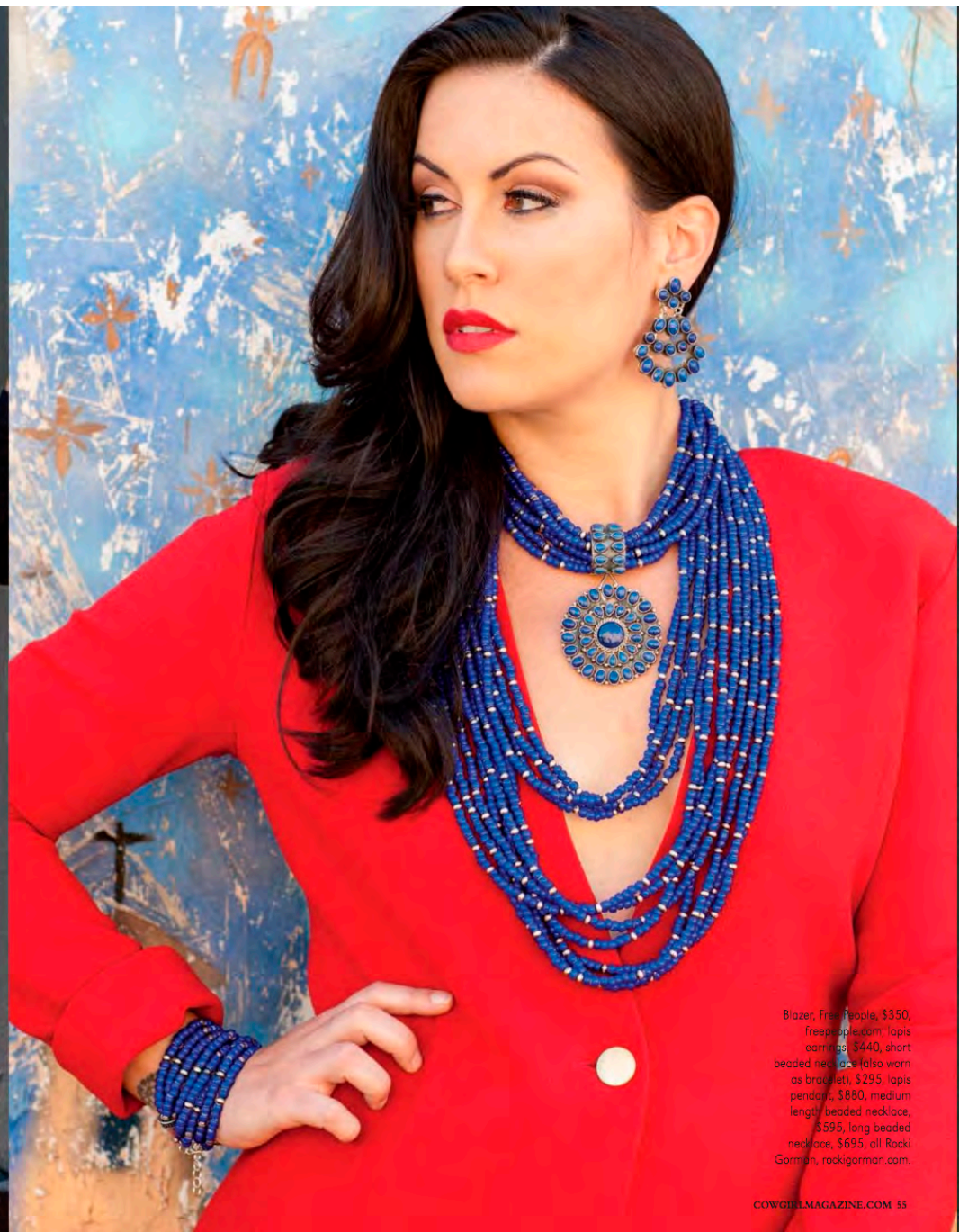
Blazer, Free People, $350, freepeople.com; lapis earrings, $440, short beaded necklace (also worn as bracelet), $295, lapis pendant, $880, medium length beaded necklace, $595, long beaded necklace, $695, all Rocki Gorman, rockigorman.com.